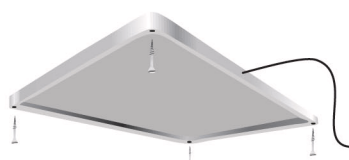
Screwing a HabiStat™ Reptile Radiator™ to the underside of the roof

Reptile Radiator™ , the location for the four fixing screws.